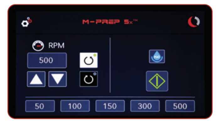
The 7" color LCD touchscreen is used to control all functions and is extremely easy to navigate, allowing greater efficiency among users.